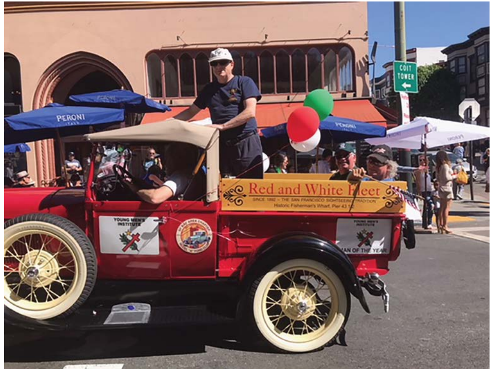
St. John Bosco Council #613 is the local YMI Council operating from St. Cecilia Parish. Brothers meet each month for a business meeting and fraternalism, and they host a social event almost on a monthly basis. All Catholic men are welcome to join, as the membership ranges from those young men in their teens to those above 90 years old!